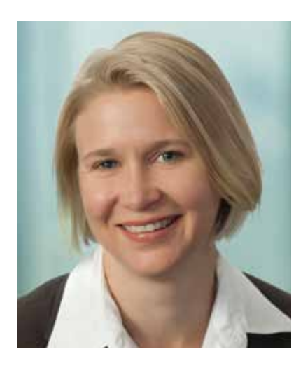
"As history teaches us, the financing of revolutions is key to their achievement"

from an engineering or technology background, they often comprise a mix of technical expertise and passion for the 'kit' core to the infrastructure build-out. But this is not sufficient. Developers need to shift very quickly to developing customers, typically by significantly boosting their sales teams. This almost always pays off and provides potential investors with a clear pathway to commercialisation, even when development and build challenges are still to be overcome.